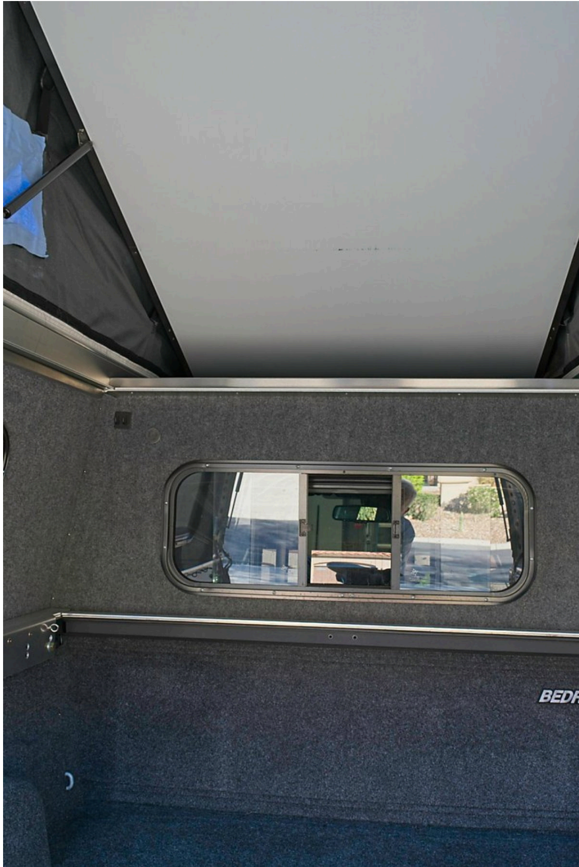
Inside Summit extended