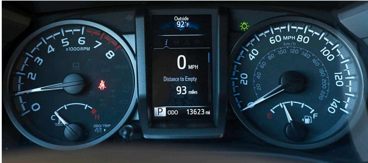
Mileage October 10, 2025