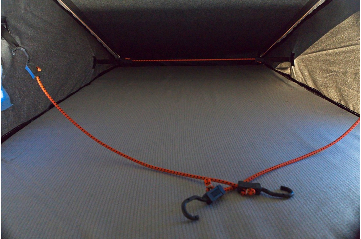
Summit sleep platform