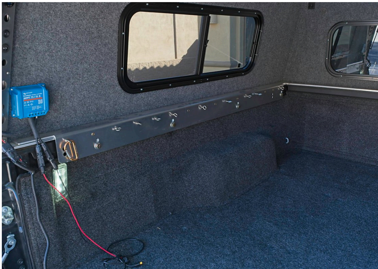
Driver side bed rug