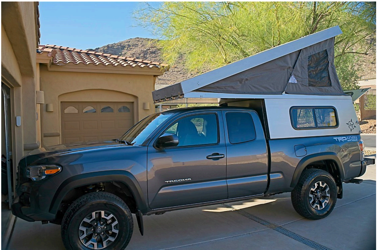
Driver side with Summit extended