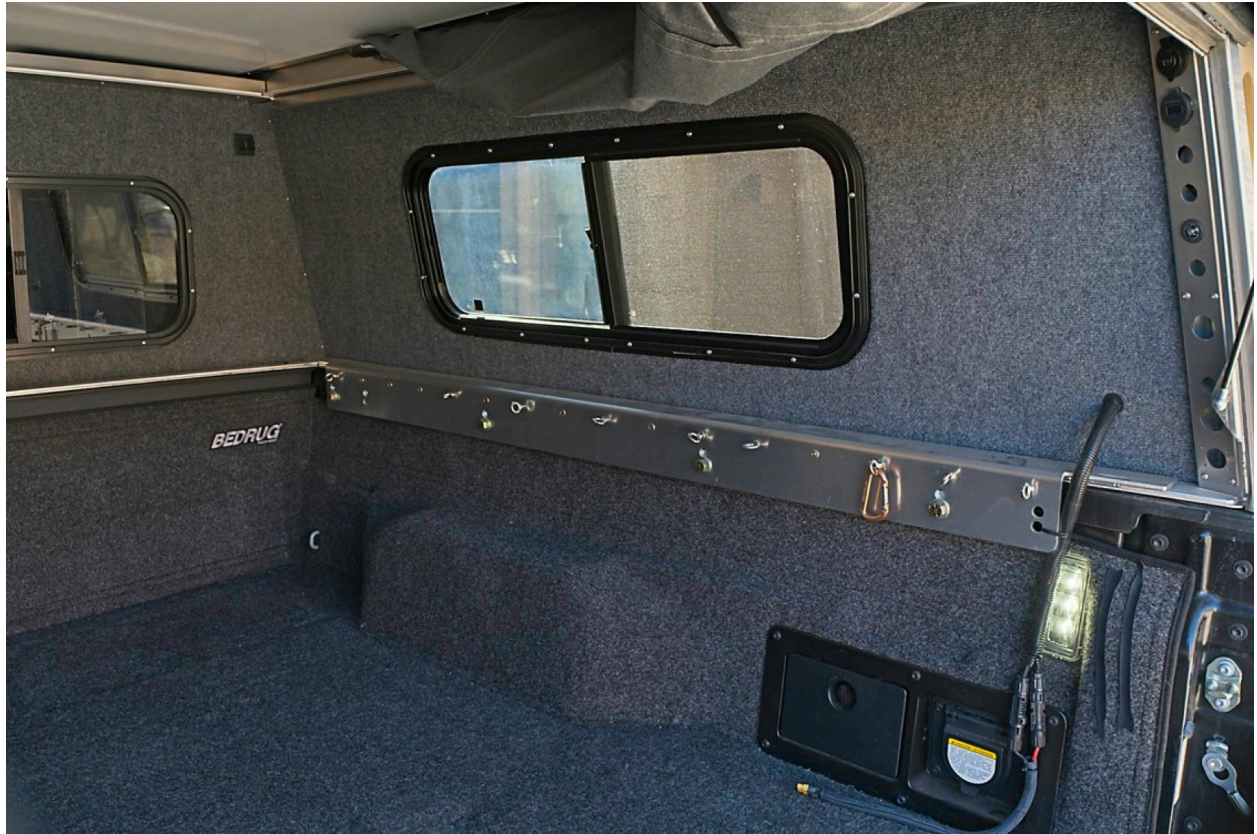
Passenger side bed rug